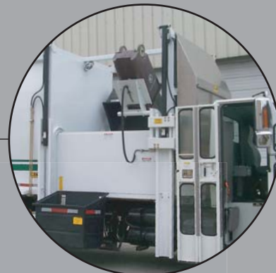
Load With Blade In Any Position and Pack-on-the-Go