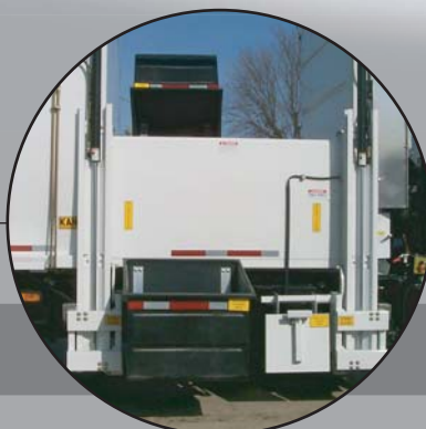
Low 35 inch Loading Height