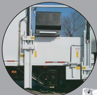
Dual Side Loader With Independent Trough and Cart Tipper