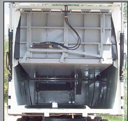
Easily removable bulkhead panels allow for compartment volume to be adjusted 50/50, 60/40, or 70/30. Each compartment has a full eject push out panel that quickly ejects all types of refuse and recyclables easily and completely clean.