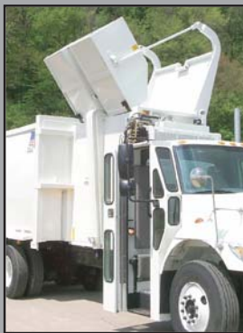
The large 1.8 yd 3 split loading trough capacity and the capability to have up to 2 cart latches mounted on the trough provides complete versatility of bag, bulk, and cart routes.