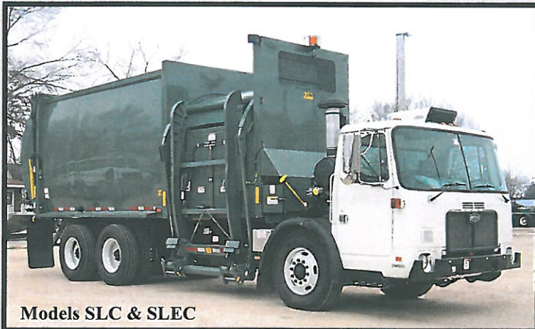
Models SLC & SLEC